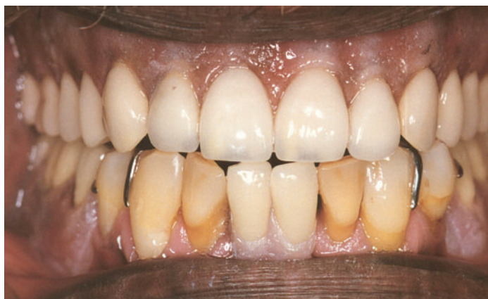
Fig. 1: Turbyfill Deluxe maxillary complete denture and mandibular partial denture with a soft liner (Molloplast, Buffalo), ethnic tinting, and Ivoclar Processing.

For patients who require improved retention and are dealing with lower budget limits, mini-implant supported dentures are an upgradeable option over Turbyfill Deluxe dentures. In figure 3a we see a patient promptly after receiving an immediate maxillary complete denture. She was unable to eat, speak or swallow and was therefore emotionally distraught over her inability to tolerate palatal acrylic coverage. After careful planning, 12 Imtec mini-implants were placed (Figs. 3b and 3c). The metal reinforced partial dentures (Figs. 3d and 3e), which have been in place now for 2 years, achieved aesthetics, phonetics and function. Both overdentures were reinforced with a metal frame to provide strength. They