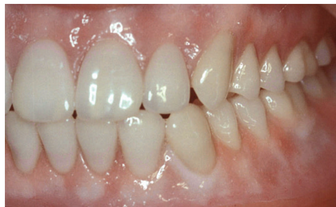
Fig. 2: Upper and lower Turbyfill Dentures with white tinting. The lower denture has a soft lining.